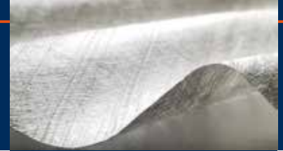
TenCate Polyfelt® TS

TenCate Polyfelt® TS geotextiles are mechanically bonded continuous filament nonwovens made from 100% UV stabilized polypropylene. They have been used for decades as separation and filtration elements in a large number of civil engineering applications.